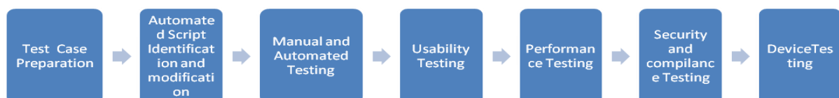
Fig 2: Mobile Application Testing Process.